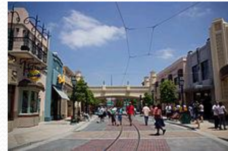
Buena Vista Street